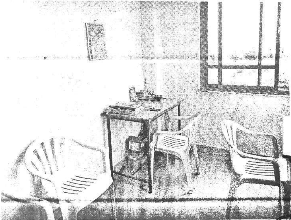
Boy's Common Room